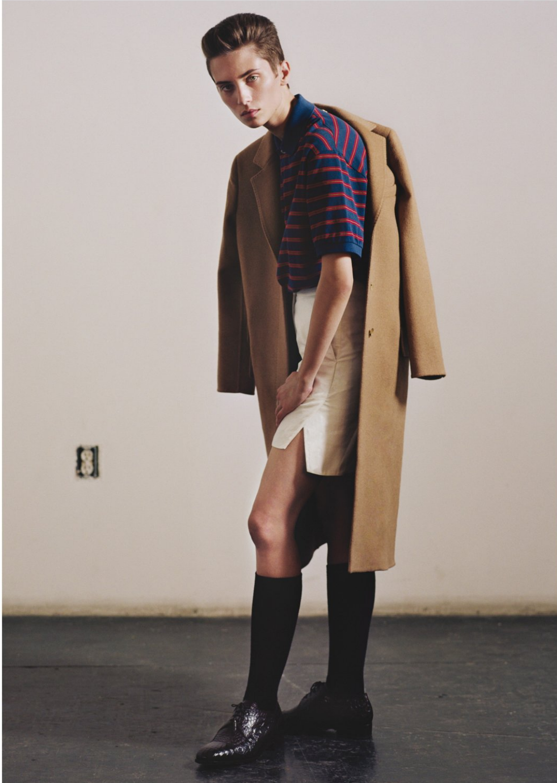
Max Mara coat, $3,690, maxmara.com . Gucci top, $580. Akris shorts, $795, akris.ch .

HEIGHT 178 CM / 5'10" | CHEST 83 CM / 32.5" | WAIST 60 / 23.5 | HIPS 90 CM / 35.5" | HAIR BROWN | EYES GREEN DRESS 36 EU / 6 US / 8 UK | SHOES 39 EU / 8 US / 6 UK