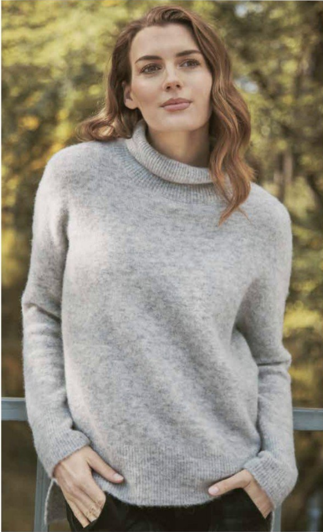
HEARTS & MORE Pullover 159 €