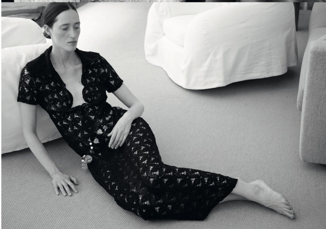
Oben: Maxikleid aus Spitze von AMY LU Unten: Maxikleid aus Spitze von BEAUFILLE. Ornament-Gürtel von TETIER BIJOUX

HEIGHT 180 CM / 5'11" | CHEST 80 CM / 31.5" | WAIST 63 / 24.5 | HIPS 89 CM/35" | HAIR BROWN | EYES BROWN DRESS 34-36 EU/4-6 US/6-8 UK | SHOES 41 EU/10 US/7 UK