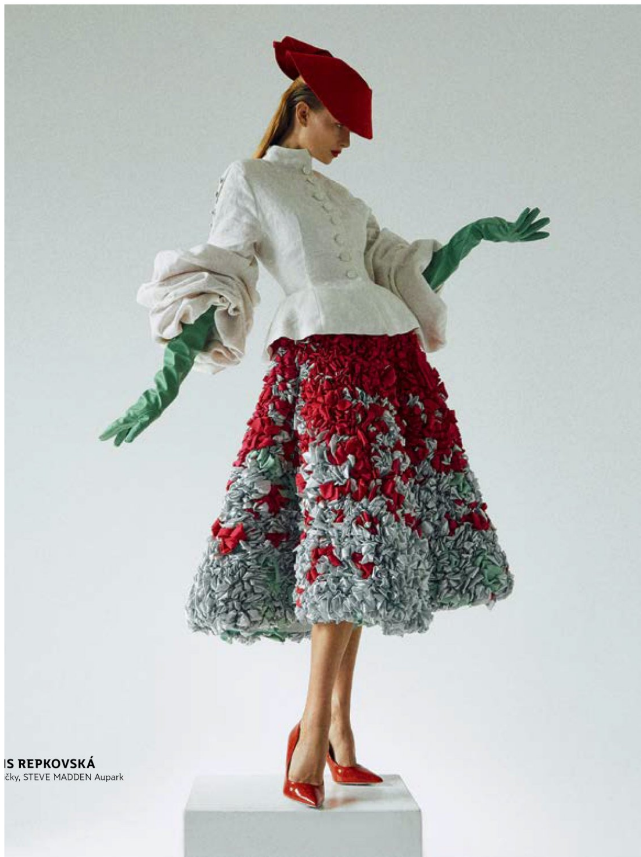
IS REPKOVSKÁ čky, STEVE MADDEN Aupark

HEIGHT 177 CM / 5'9.5" | CHEST 81 CM / 32" | WAIST 61 / 24 | HIPS 88 CM / 34.5" | HAIR LIGHT BROWN | EYES BLUE-GREEN DRESS 34-36 EU / 4-6 US / 6-8 UK | SHOES 38.5 EU / 7.5 US / 5.5 UK